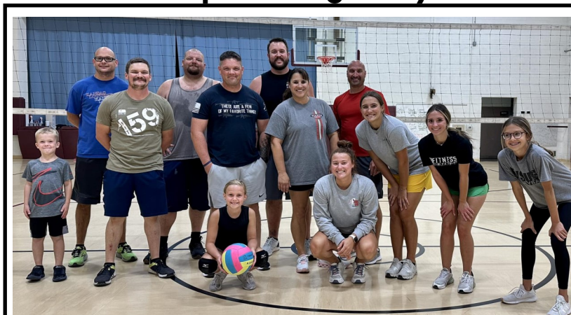
Drop-in volleyball players take time out for a photo op. This is one of the many opportunities the Rec has offered recently.

The Victoria Recreation Commission has provided community members with new options for activities in recent months. Drop-in Tennis was held on Sunday evenings this summer through the fall; Drop-In Volleyball is ongoing in the VES gym from 6:30-7:30 on Wednesdays through the winter.